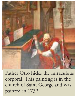
Father Otto hides the miraculous corporal. This painting is in the church of Saint George and was painted in 1732