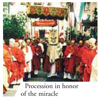
Procession in honor of the miracle