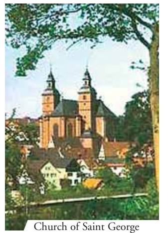
Church of Saint George