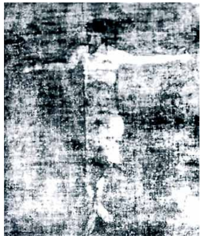
The Crucified Christ is clearly distinguished under ultra violet lighting